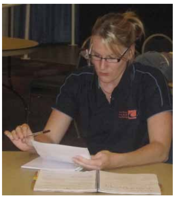
Youth Round Table presentation

Consumer Affairs staff are happy to come and talk to school groups, uni students, workplaces, or organisations about consumer protection topics such as scams, shopping or tenancy. Give us a call on 1800 019 319 or email consumer@nt.gov.au to chat about what is needed.